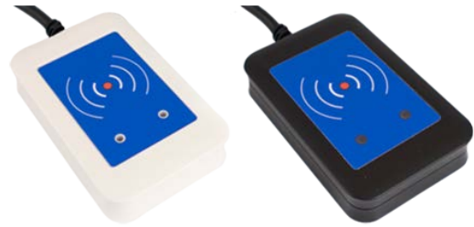
Desktop version (inlay customizable)

Elatec's TWN4 family of transponder readers and writers allows users to read and write to almost any 125 kHz, 134.2 kHz and 13.56 MHz tags and/or labels – it supports all major transponders from various suppliers like ATMEL, EM, ST, NXP, TI, HID, LEGIC, etc. and ISO standards like ISO14443A/B (T=CL), ISO15693, ISO18092 / ECMA-340 (NFC).