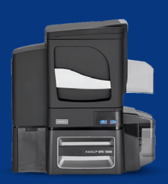
HID FARGO DTC1500 featured with optional lamination