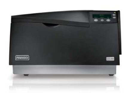
Versatility starts here. A basic DTC550 uses Fargo's Direct-to-Card technology to print full-color, single- and dualsided cards. Match specific needs with connectivity, lamination and e-card encoding options.

tection for the DTC550 and your entire card issuance system. Print Security software adds password-controlled access to the DTC550. It can notify key personnel by text message or e-mail whenever printing is attempted outside of authorized hours.